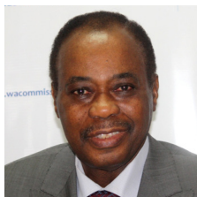
Edem Kodjo (Togo) Former Prime Minister of Togo