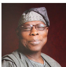
Olusegun Obasanjo Chair (Nigeria) Former President of Nigeria

To ensure that the Commission's findings and recommendations are widely discussed and acted on, its members engage in a follow-up advocacy campaign with governments, regional and international bodies, civil society and the media.