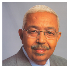
Pedro Pires (Cabo Verde) Former President of Cabo Verde