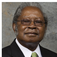
Justice Bankole Thompson (Sierra Leone) Former Judge on the Special Court for Sierra Leone